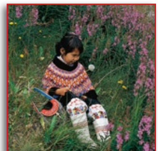
Greenland Sami Girl