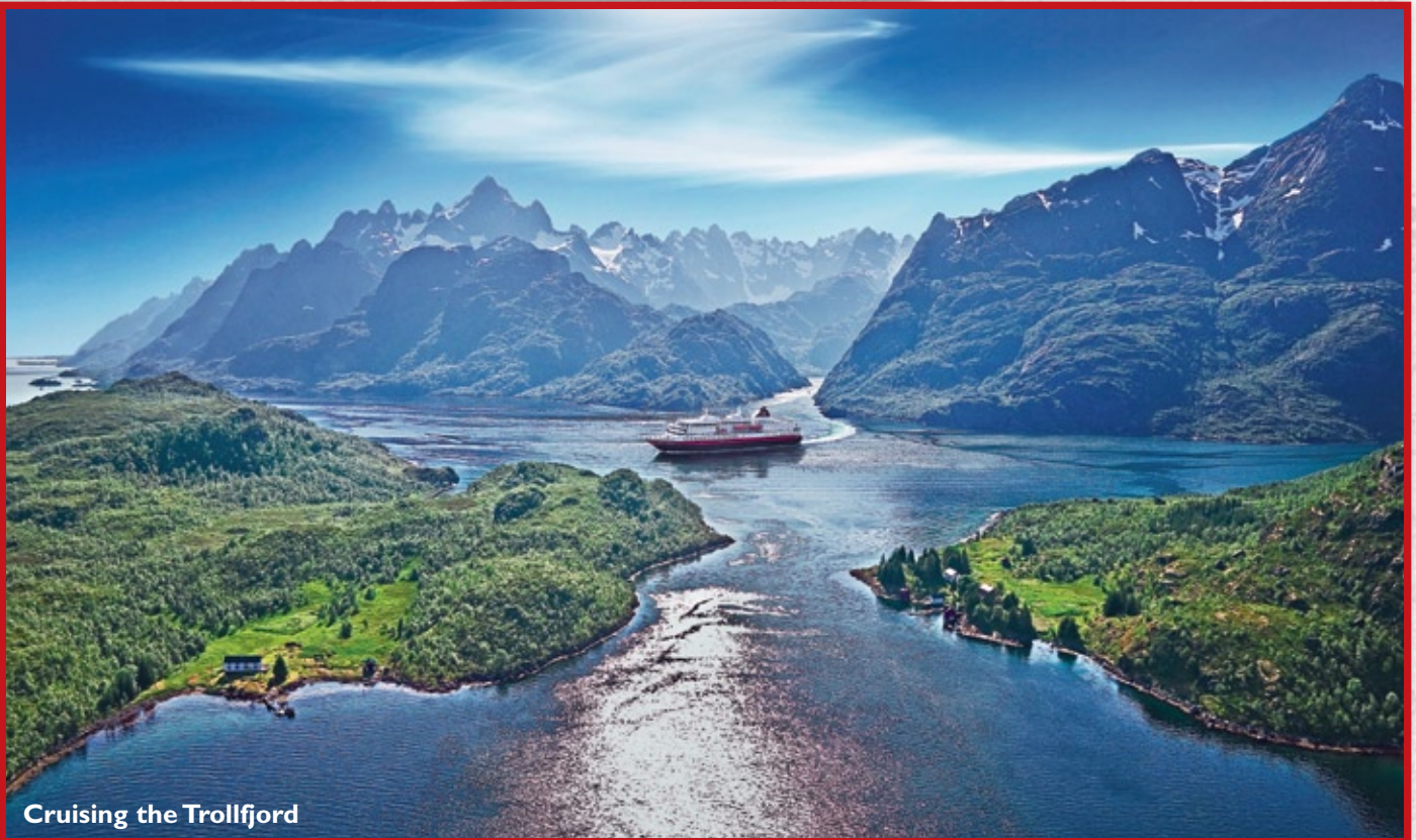
Cruising the Trollfjord