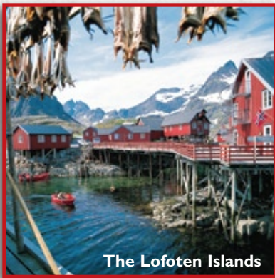
The Lofoten Islands