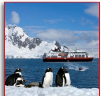
Penguins and Fram in Antarctica