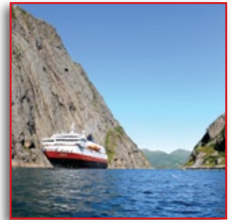
Nordlys in Norwegian Fjord

Enjoy the spring traveling on our Western Europe Voyage where you can explore the most enchanting ports on the Atlantic coast. Celebrate Easter in the Norwegian Fjords or join us on a voyage to some of the most captivating cities in the Baltic Sea. In the fall, explore the isles that lie among the wild waters of the northern British and Irish Sea before visiting of the highlights of the Irish mainland or explore the autumn colors of Western Europe and discover the exotic mysteries of North Africa. These unique European cruises offer something for everyone on the elegant MS Fram .