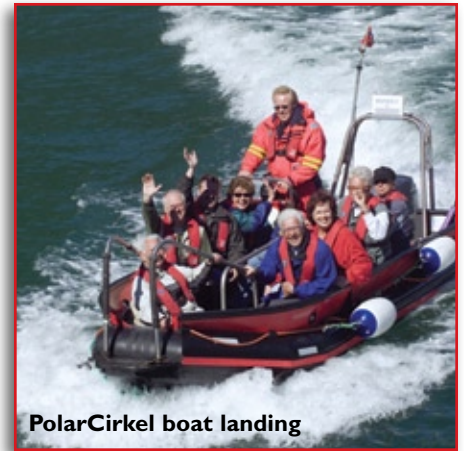
PolarCirkel boat landing