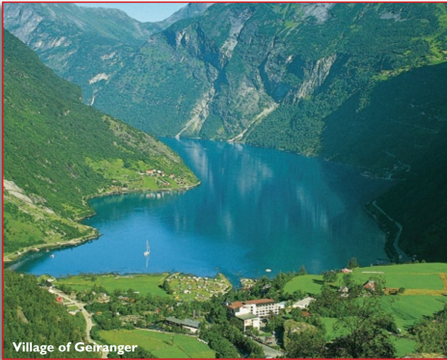
Village of Geiranger