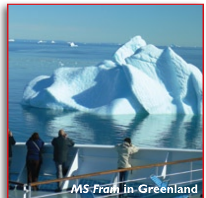
MS Fram in Greenland