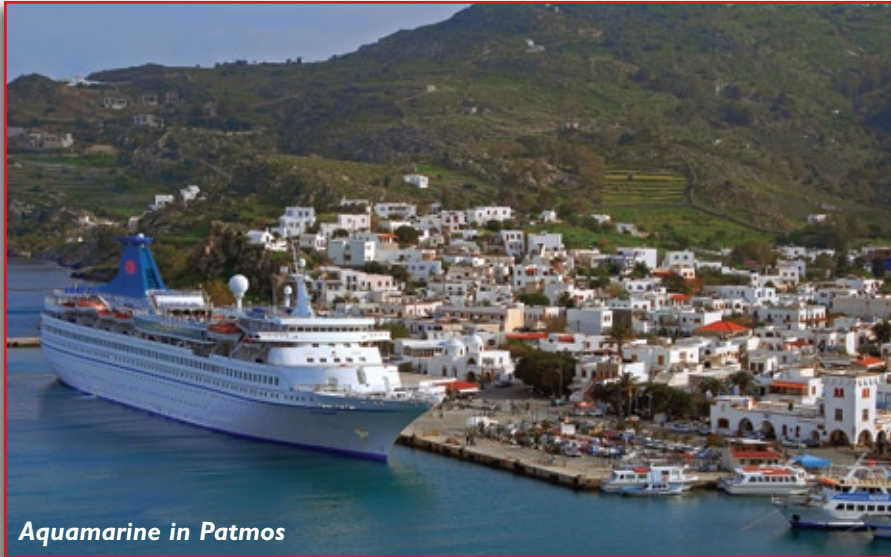
Aquamarine in Patmos